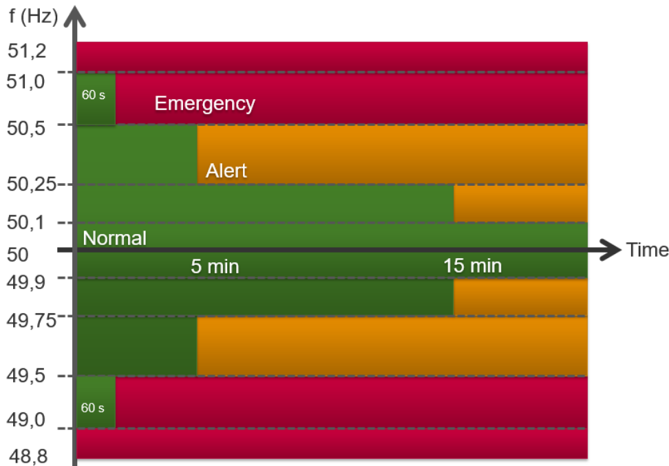
Figure 2: System state limits with respect to frequency in the Nordic power system. Normal state is shown in green, Alert state in yellow and Emergency state in red.

The power system is considered to be in different states depending on the actual frequency, frequency deviation in case of a disturbance, controllability and observability of the frequency. There are five different system states: Normal, Alert, Emergency, Blackout and Restoration [1]. The first three of them are illustrated in Figure 2 with respect to frequency.