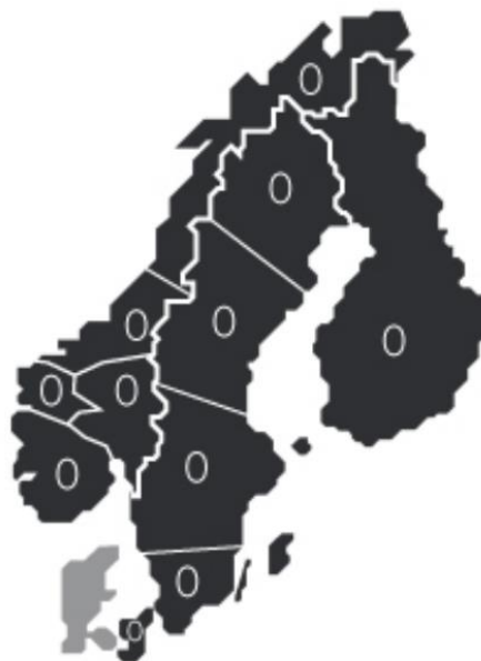
Figure 4: Left: Current Nordic balancing model where only frequency is considered. Right: New balancing concept where the balancing is carried out using the ACE of every bidding zone.

New balancing concept – balanced ACE for each sub region