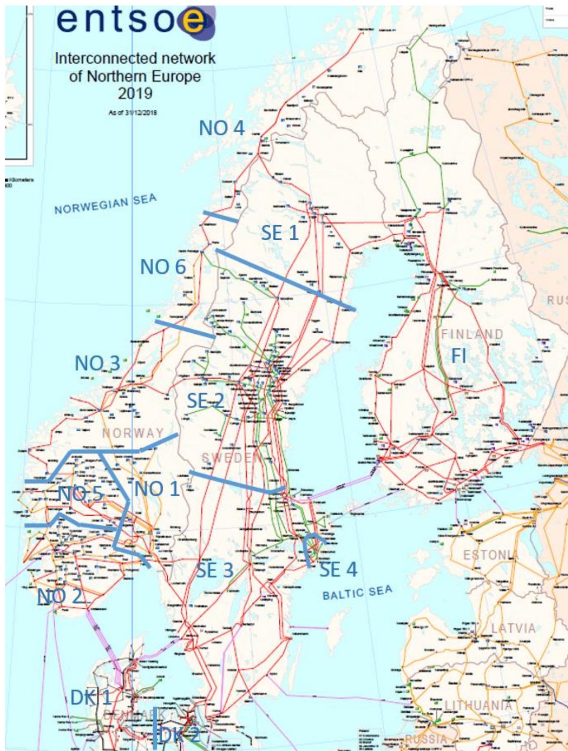
Figure B: Alternative configuration to be analysed for Sweden and Norway. In the proposed configuration regarding Sweden, a modified BZ SE3 is introduced in the Stockholm Metropolitan Area. The current BZ SE4 is expanded to include the remaining area of current BZ SE3. In Norway a split of NO4 is proposed, and a new BZ NO6 is introduced. For Denmark and Finland no alternative configuration will be assessed at this stage.